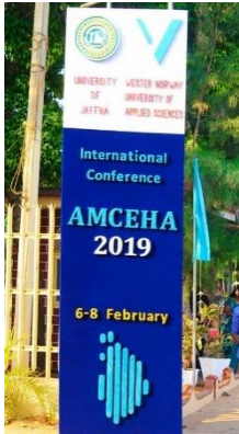
At the entrance

Day 1 & 2 (06 & 07.02.2019, Wednesday): Inauguration, plenary and poster session At Kailasapathy Auditorium and Library Auditorium, University of Jaffna, Thirunelveli